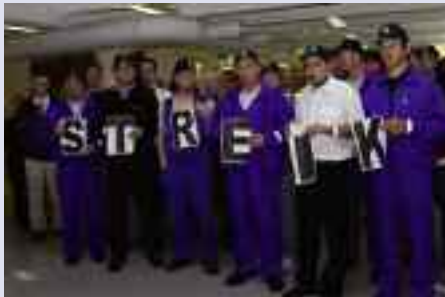
On strike: Estonian seafarers.

“The unions held demonstrations and peace marches, lobbied government and briefed the media on the case of the seafarers. They were finally released in late November 2008, after being held for two months.”