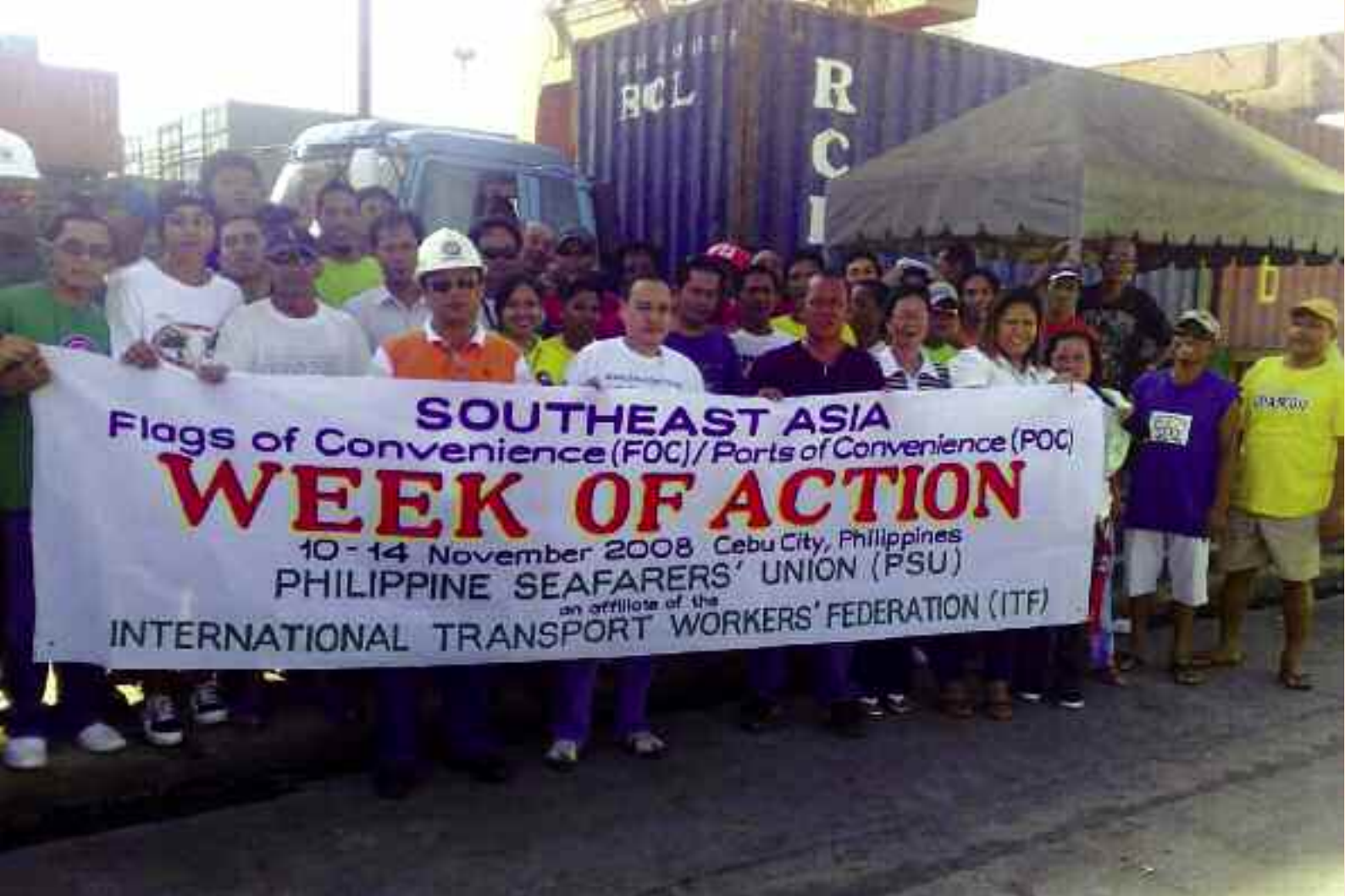
Dockers in south east Asia show their support for seafarers by delaying work during a recent week of action.

D ockers, stevedores, longshoremen and wharfies – the name may vary between countries, even in English, but the skilled job of cargo handling is one that seafarers have traditionally respected, despite the pressures on them to handle cargo themselves. Dockers’ and seafarers’ unions agree that seafarers should use their skills in sailing the ships and bringing them to port, and that dockers should use their skills in handling and unloading the cargo they carry. That is recognised in the ITF collective agreement, which states that ships’ crews should not be required to handle cargo.