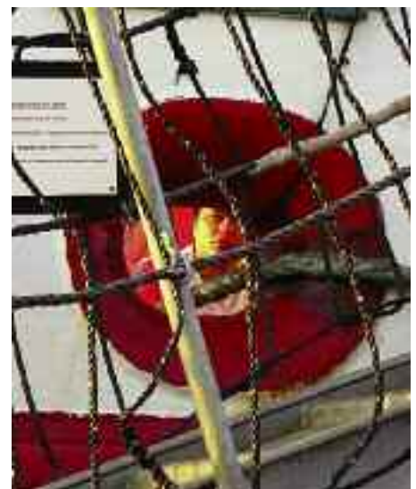
Seafarers are suffering as the downturn hits jobs and wages.

● Brenda Kirsch is a London-based freelance journalist.