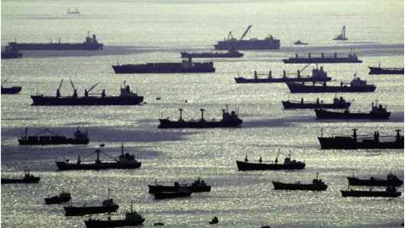
Ships at anchor off Singapore; in November 2008, the world's biggest container port, Singapore, reported its first fall in shipping traffic since 2001.

conditions also saw a steep erosion of freight rates.