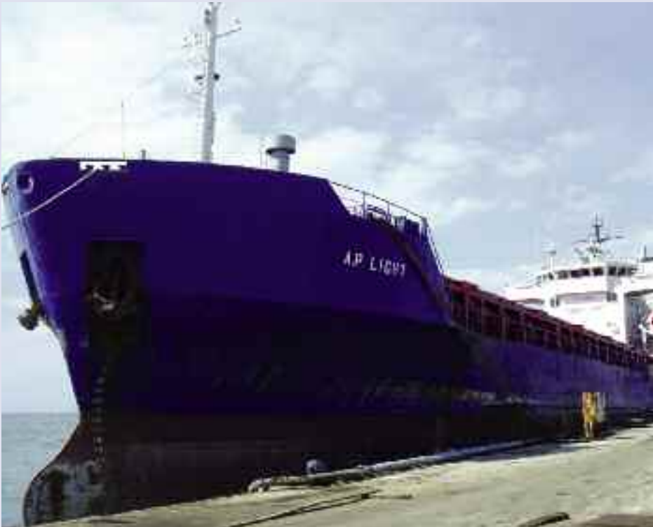
The AP Light: crew members were left without wages until the ITF stepped in.