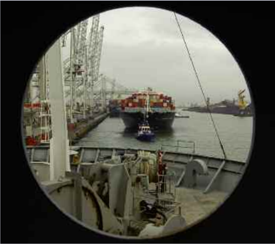
Italian dockers want a zero tolerance approach to safety.