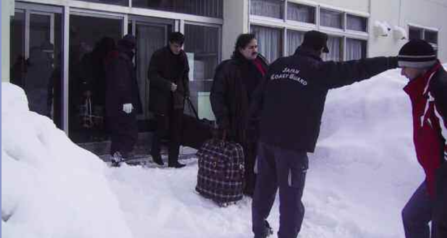
Going home: the crew of the Derbent .