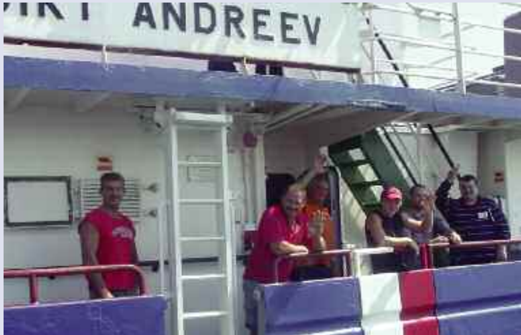
The crew has won US$100,000 with the help of the ITF.